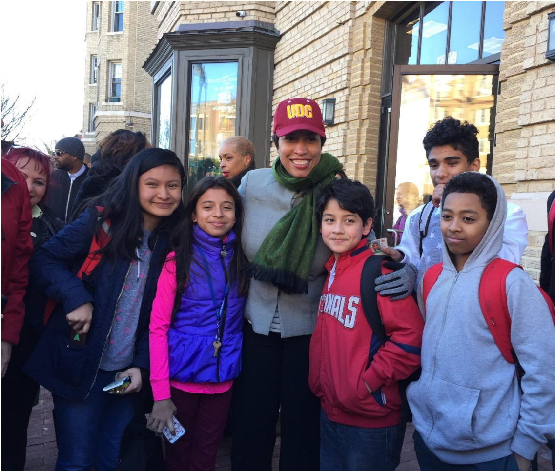
Mayor Bowser engaging students in Mount Pleasant and discussing the importance of DC One Cards