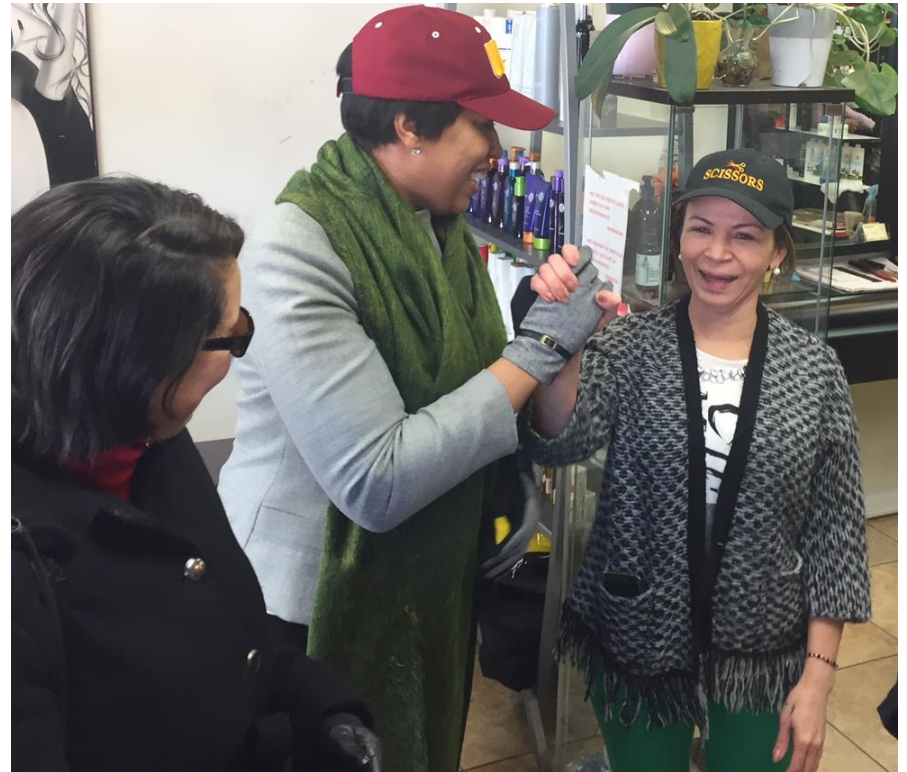
Golden Scissors Hair Salon