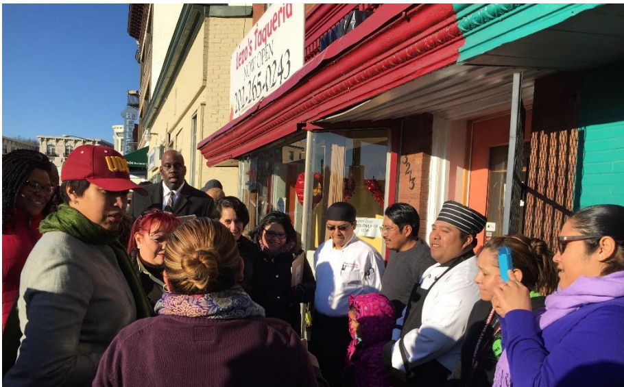
Lezo's Taqueria Restaurant