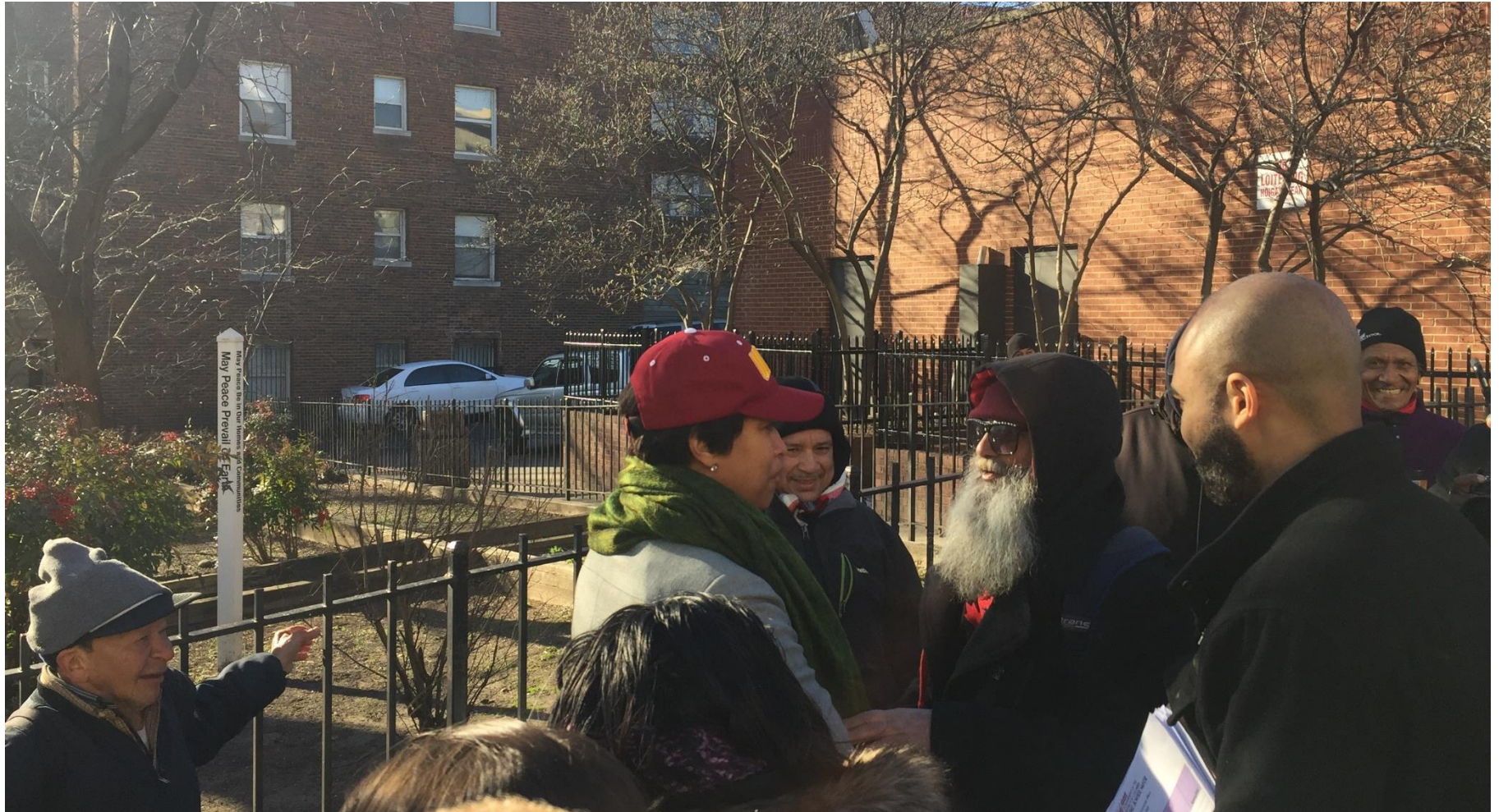
Mayor Bowser listening about the concerns of the residents regarding “Amigos” Park in Mount Pleasant